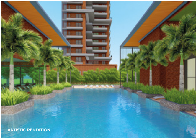
Physical Wellbeing: Designed to promote movement, with minimal surface vehicular circulation and abundant sports amenities

Estate 128 has been designed with meticulous attention paid to every element. We're determined to create a unique confluence of spaces that enable holistic wellbeing across physical, social, emotional, and environmental aspects of wellness.