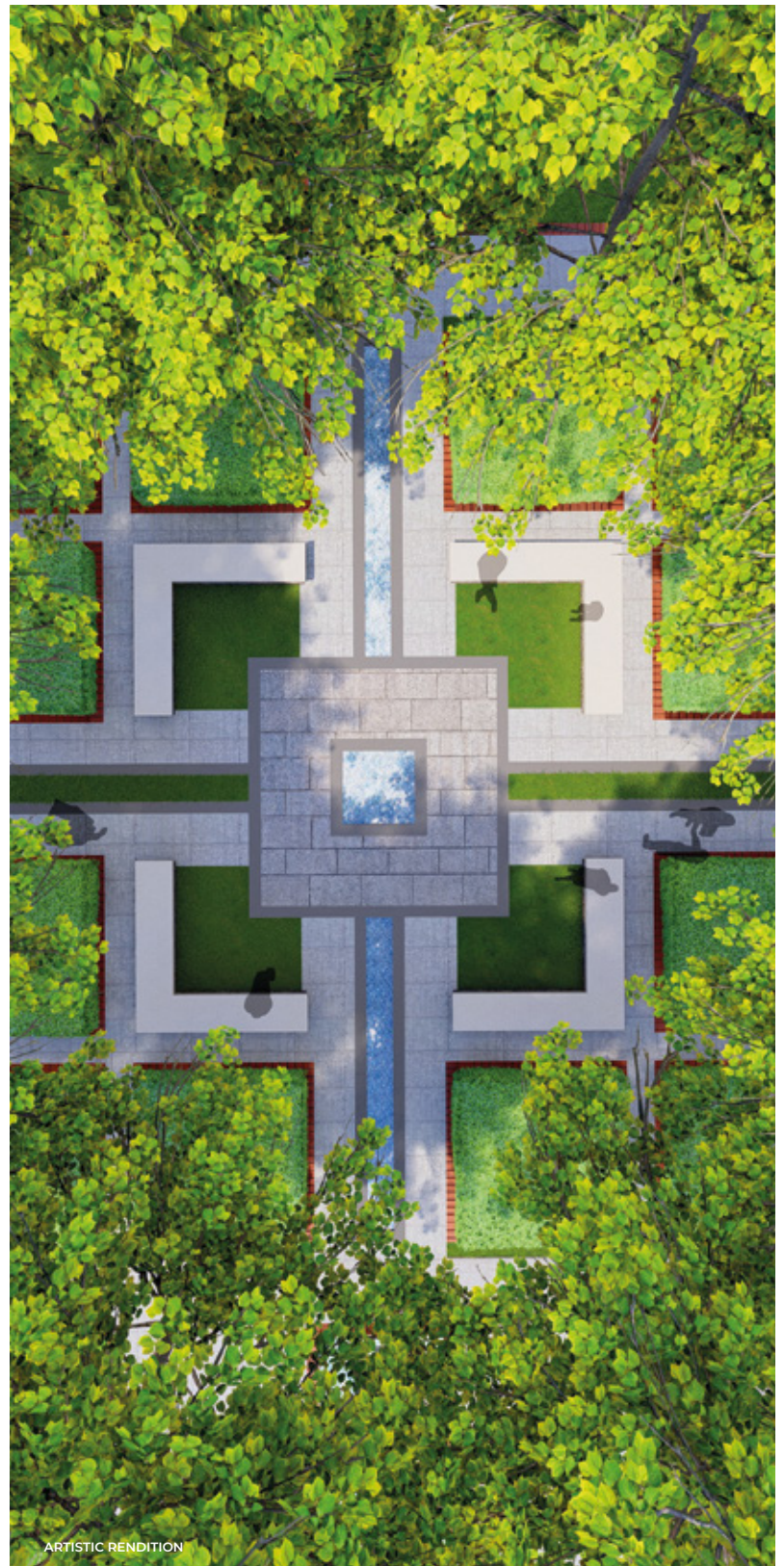
Environmental Wellbeing: Designed with sustainable practices at the forefront, from sourcing to execution