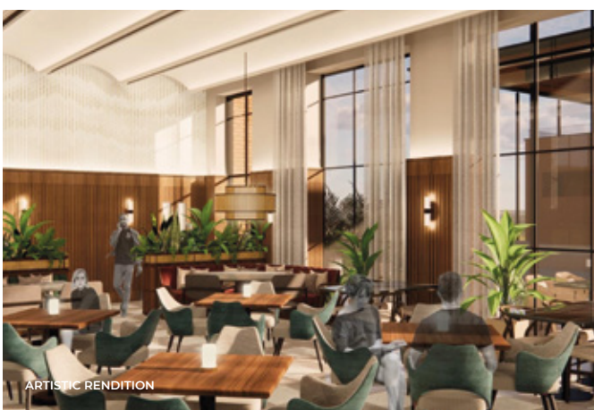
Social Wellbeing: Designed for engagement and interaction, with amenities like all day dining and open cabanas, to foster a like-minded community