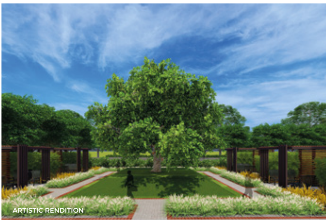
Emotional Wellbeing: ~7 acres of open green space to allow you to rejuvenate in nature, even in the bustling cityscape